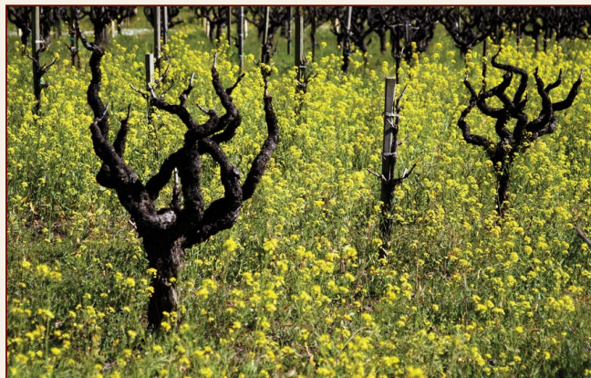
GNARLED OLD VINES